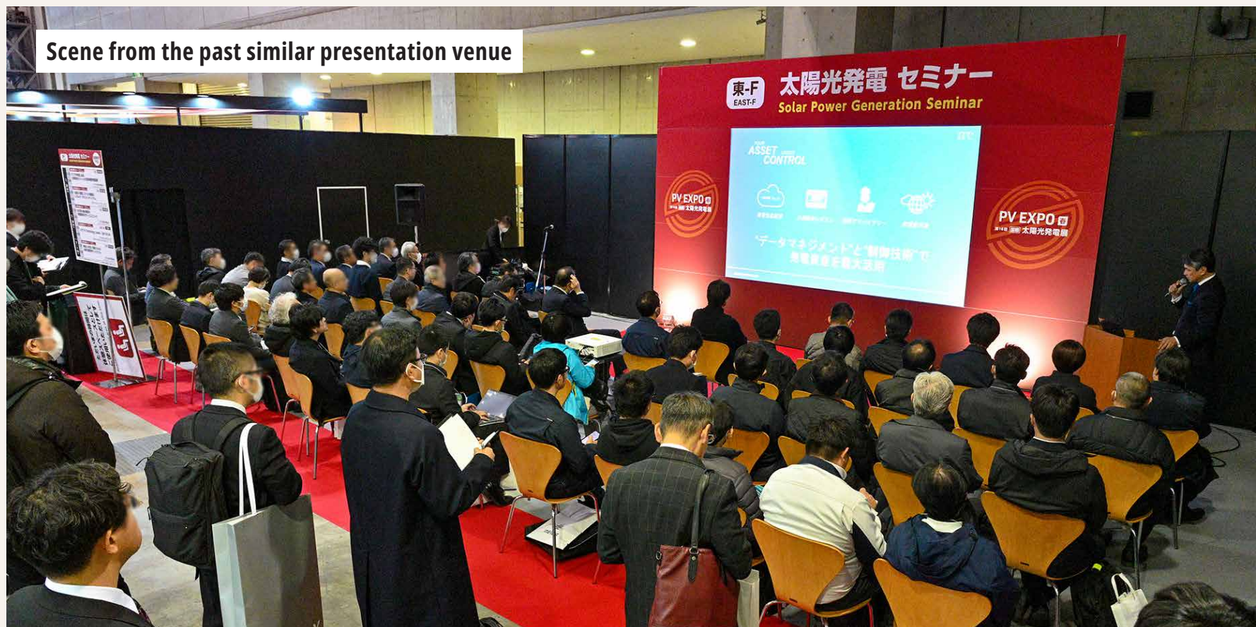
Scene from the past similar presentation venue

You can promote your technologies/products through presentation.